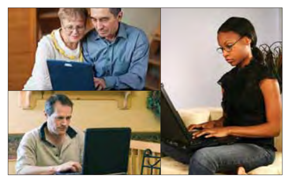
NEFE Fosters Peer Learning Online continued from page 1

Since 2005, NEFE has satisfied consumers' desire to learn and address their financial problems online with its website, www.smartaboutmoney.org. Smart About Money is designed to be there for consumers throughout their lifetime of financial decisions. Now, visitors to the site also can learn from one another with the Smart About Money Community.