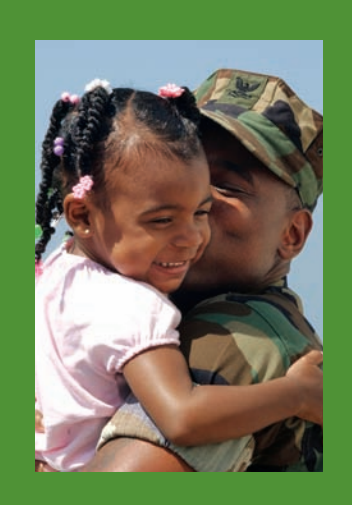
A credit card can have a place in your life—if you handle it carefully.